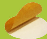
Circular sticky card